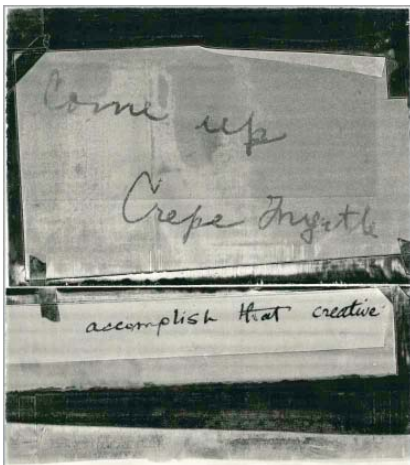
Sincere Endeavors To , 30" x 22 1/2", Monoprint